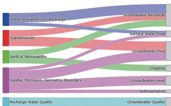
Fig. 2 The conceptual relationships between MAR factors and criteria through a Sankey diagram. The factors are positioned on the left, flowing towards the criteria on the right, visually depicting how each factor contributes to affects various criteria

To further illustrate these relationships, Fig. 2 illustrates the conceptual relationships between MAR factors and criteria through a Sankey diagram, where the width of each band represents the strength of a factor's impact on a given criterion. The diagram visually maps these influences, using color-coded factors to depict their significance in determining MAR success. By integrating these real-world insights, this section bridges the gap between theoretical frameworks and practical experiences, providing a comprehensive perspective on how critical factors collectively shape the success and sustainability of MAR initiatives.